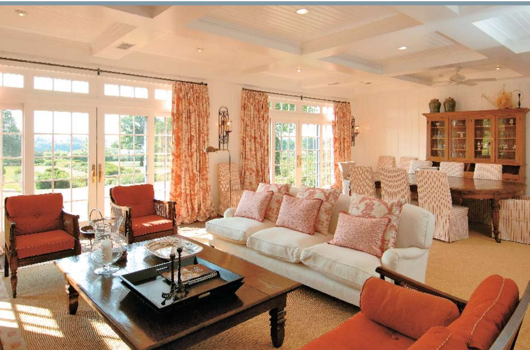
Elegant yet inviting, the living and dining rooms contain American and European antiques.

The remodeling project didn’t stop within the house. To reflect the elegance and comfort of the interior, the Simons wanted an equally inviting and beautiful garden. Enter the driveway lined with 300 cedar trees, past mass groupings of taxus and boxwoods, and it may be hard to imagine the 10