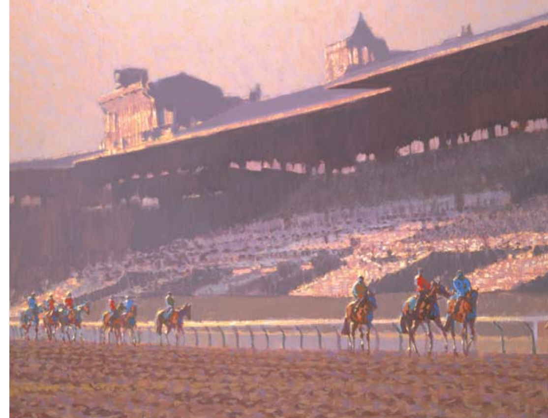
Before the Race, Breeders' Cup, Churchill, oil on canvas, 20" x 24"