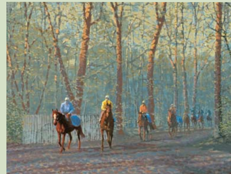
Above, Exercising, oil on canvas, 20" x 24" Below, Early Morning Exercise, oil on canvas, 20" x 24"

French Impressionists have influenced Peter Howell's work.