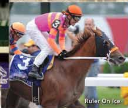
Ruler On Ice