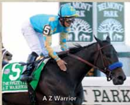
A Z Warrior