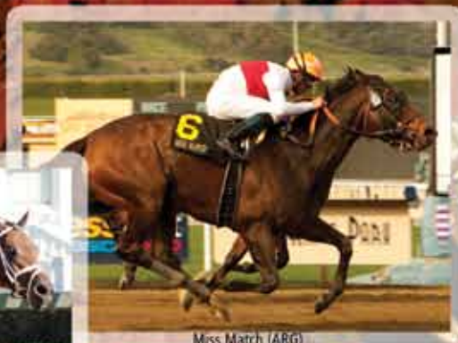
Miss Match (ARG)