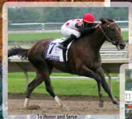
To Honor and Serve